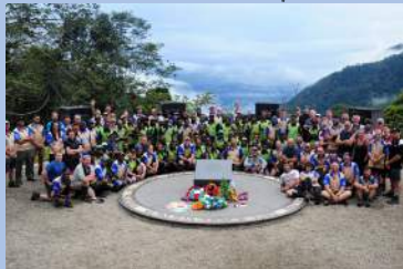
KOKODA TRACK TREK