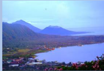
AN&MEF & RABAU TOUR