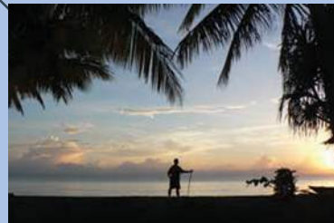
KOKODA TRACK & NORTHERN BEACHHEADS TREK