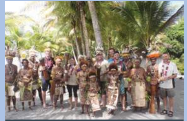
MILNE BAY, KOKODA & NORTHERN BEACHHEADS TOUR