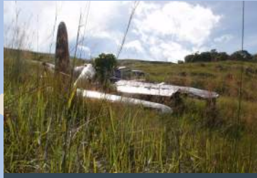
BLACK CAT TRACK TREK