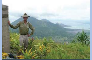
LARK FORCE TREK