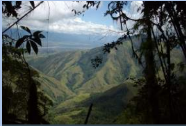
SHAGGY RIDGE TREK