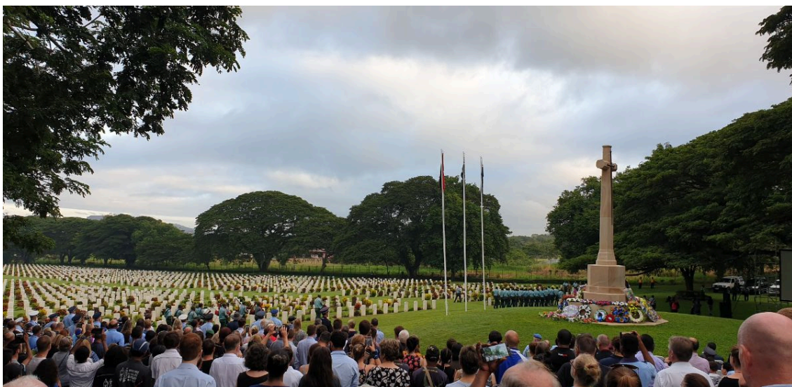
ANZAC DAY 2022