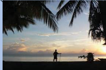
KOKODA TRACK & NORTHERN BEACHHEADS TREK