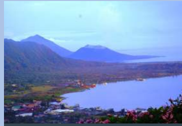
AN&MEF & RABAU TOUR